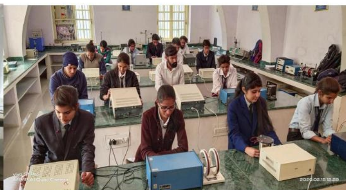
M.Sc. Physics Lab