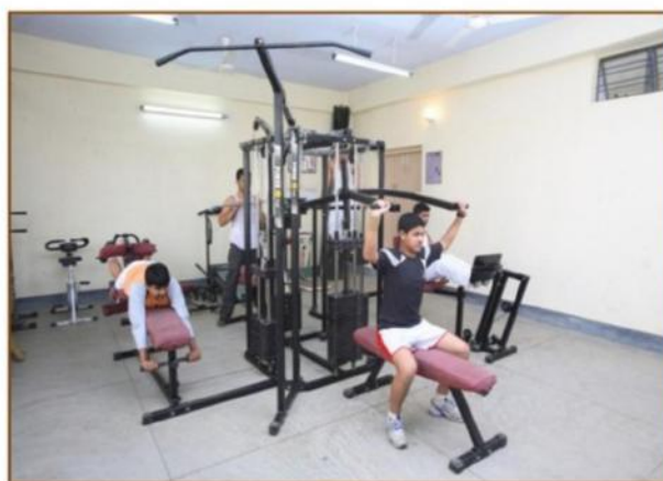
College Students working out in the Gym