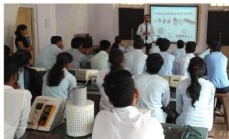
Group discussion, Physics Department