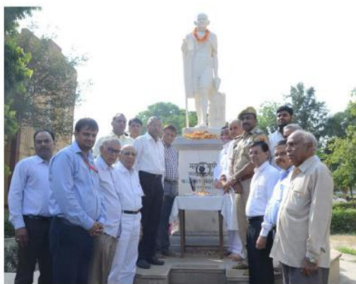
Gandhi Jayanti Celebration