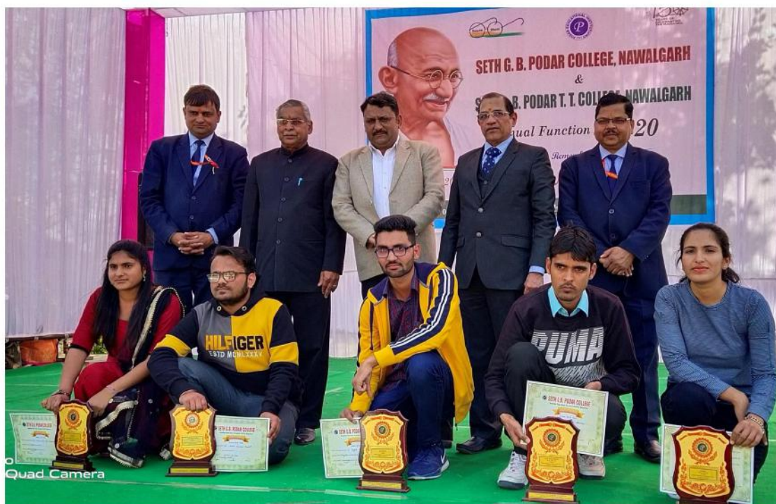
Our University Merits of 2019