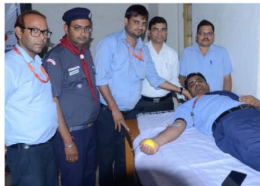
Blood Donation Camp on 2nd October