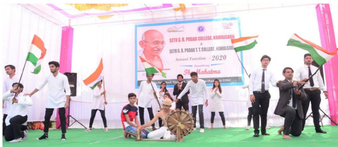
Some Glimpses of Annual Function – January 2020