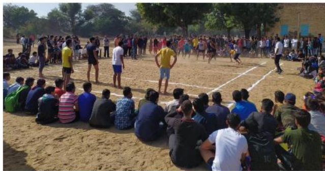
Sports week-Kabaddi Competition