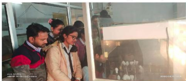
Culture Room, Botany Department