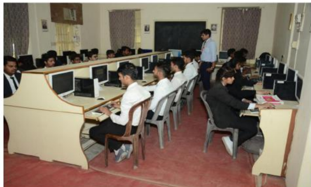
IT Students at Work in the Computer Lab