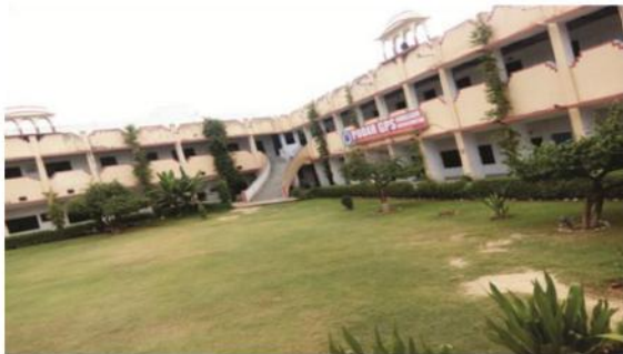
Smt. Godavaribai Ramdeo Podar Sr. Sec. School, CBSE (English Medium)

This college has the distinction of being the first undergraduate college in the erstwhile state of Jaipur. The College is an important part of the chain of institutions running under the Trust, the main objective of which has been to provide education. To give concrete shape to this objective, the Trust has established over 50 schools, management institutions, medical and technical institutions that are imparting education to thousands of students across the country.