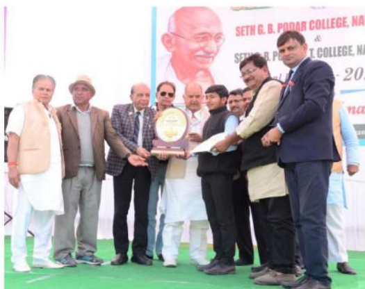
Best Student of the year 2019-20