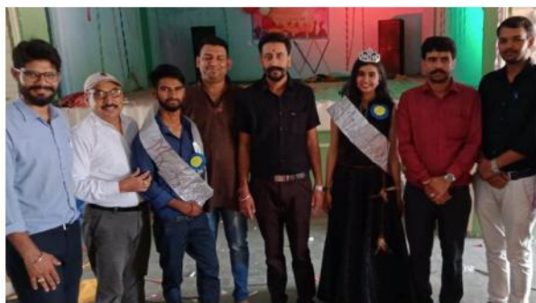
Miss and Mr. 2019 in Chemistry Department