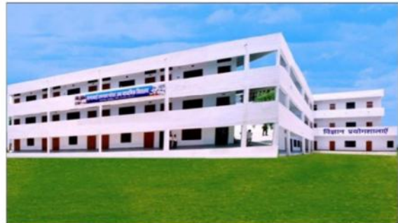
Panabai Ramnath Podar Sr. Sec. School, (Hindi Medium)