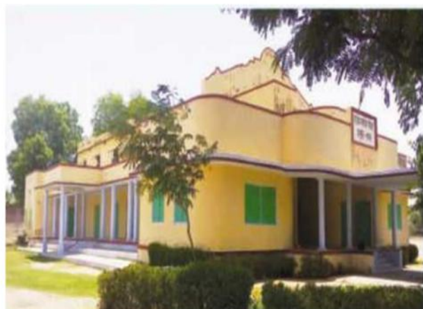
Raja Ramdeo A. Podar Smriti Bhawan (Sports Complex)

Our college owns a fleet of buses and these buses operate along nearly all suitable routes in and around Nawalgarh and its all local routes. Our transport facilities ensure that our students and staff are able to reach the college on time.