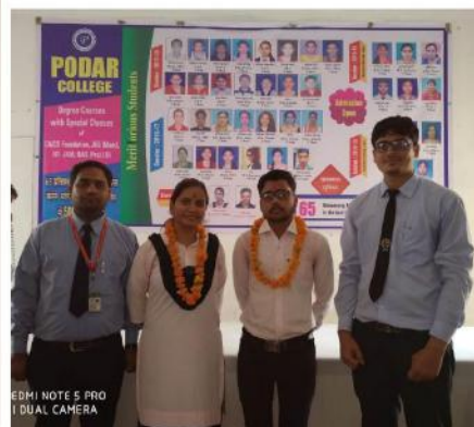
Scored 100% marks in Maths