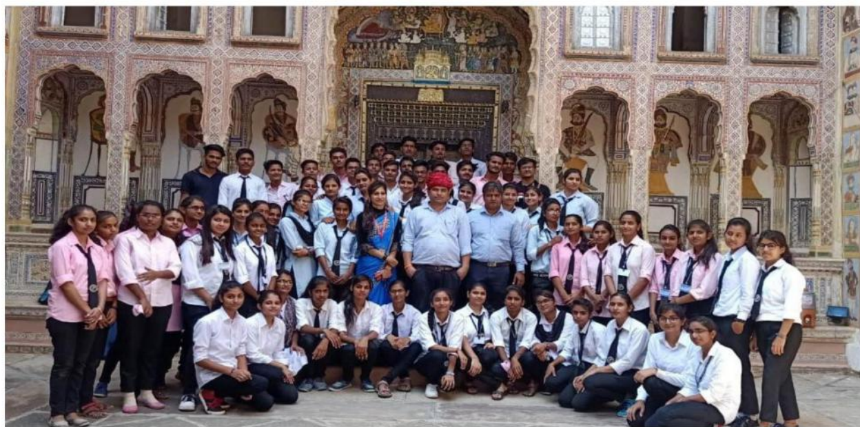
Visit of Podar College students to Podar Museum