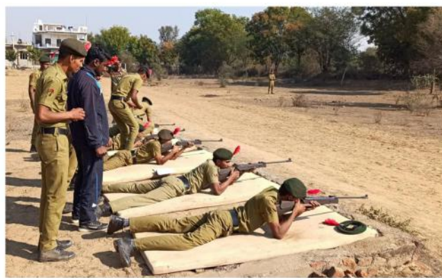
Training of Firing to NCC cadets of the college