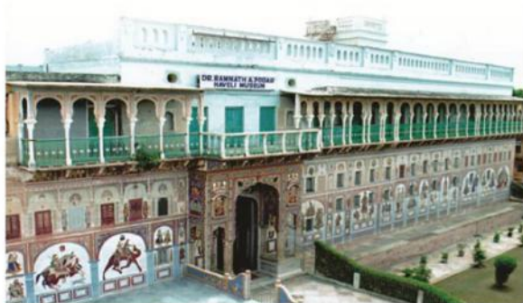
Podar Haveli Museum