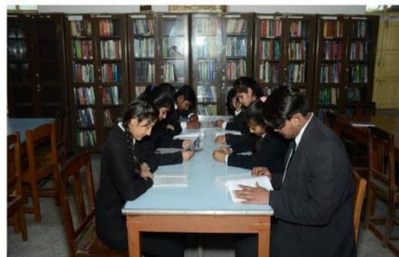
Students at study in the Reading Room