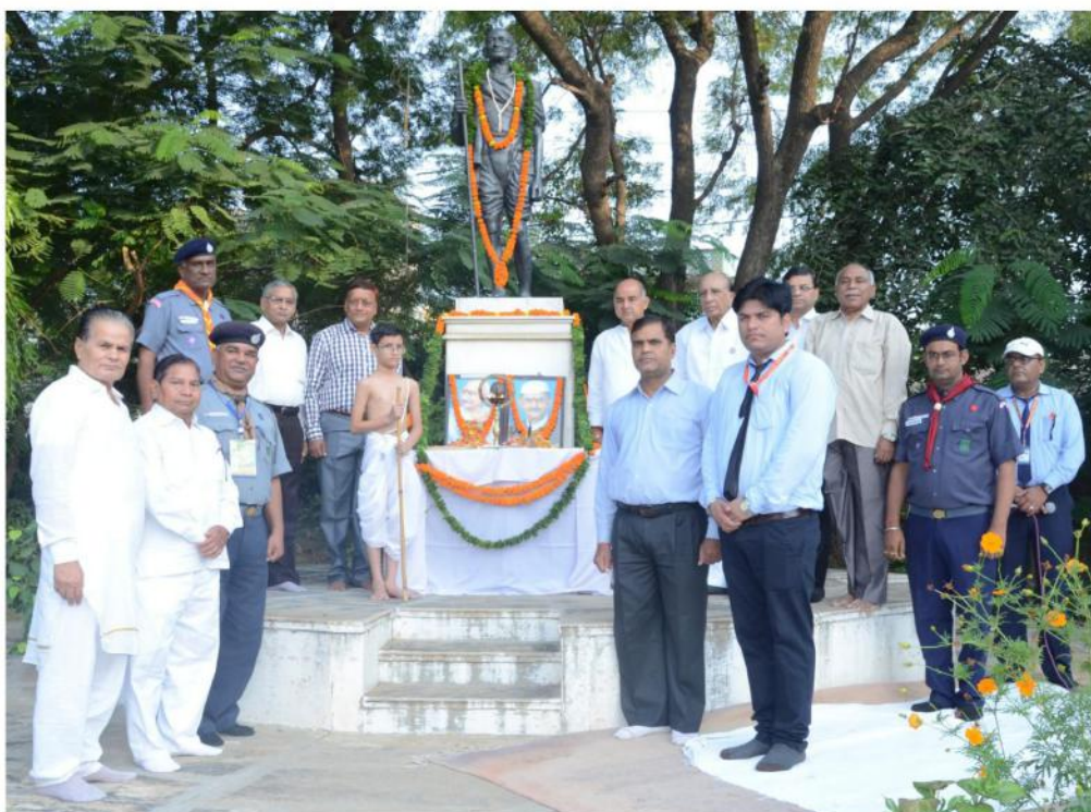
Mahatma Gandhiji Centenary Celebration at Gandhi Park, Nawalgarh

ICSI Study Centre: In this centre the college provides the facility of extra classes to prepare the students for CA/CS foundation Courses.