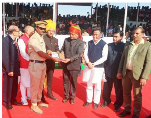
First Place in Republic Day Parade at Nawalgarh