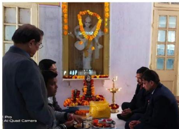
Saraswati Poojan on Vasant Panchmi