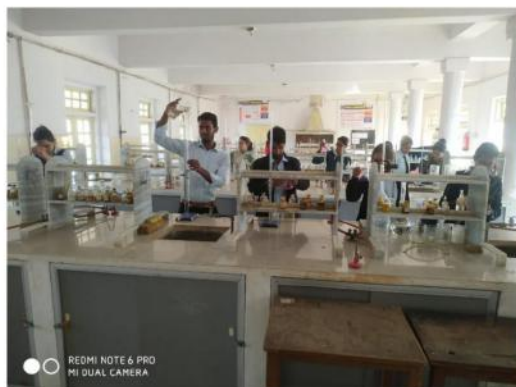
M.Sc. Chemistry Lab

We have separate labs for Physics, Chemistry, Botany, Zoology and Geography. Each of these labs is fully equipped with all the latest equipments, apparatus and experimental kits.