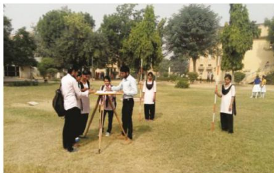
Geography Students doing Field Survey