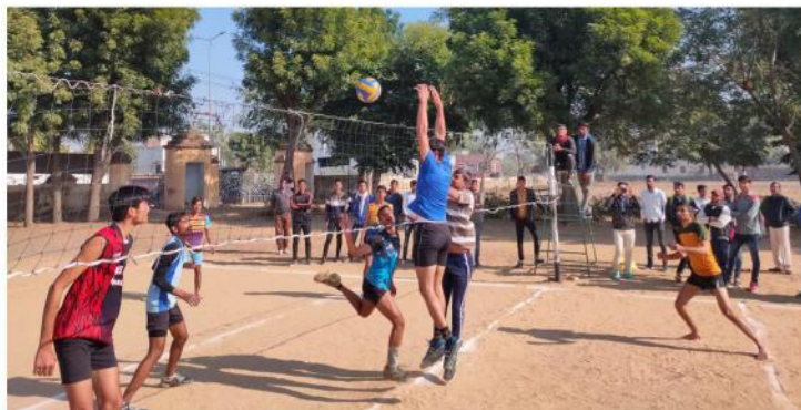
Sports week-Volleyball Match